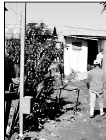
A favela house

While in Brazil last year, the school was on winter break (remember the seasons are reversed in the southern hemisphere). However, the teachers were still hard at work. Because the children of the favela have nowhere else to go, the school continues to run education programs during the breaks. We had the privilege of speaking with the children during English lessons and hearing two songs welcoming us to their school. The staff members were happy to be with the children, even though it should have been break time for them. They truly have a love for the work of the Lord in these poor communities of their city.