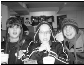
Good memories from last year